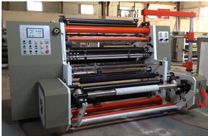
Web guiding sensor